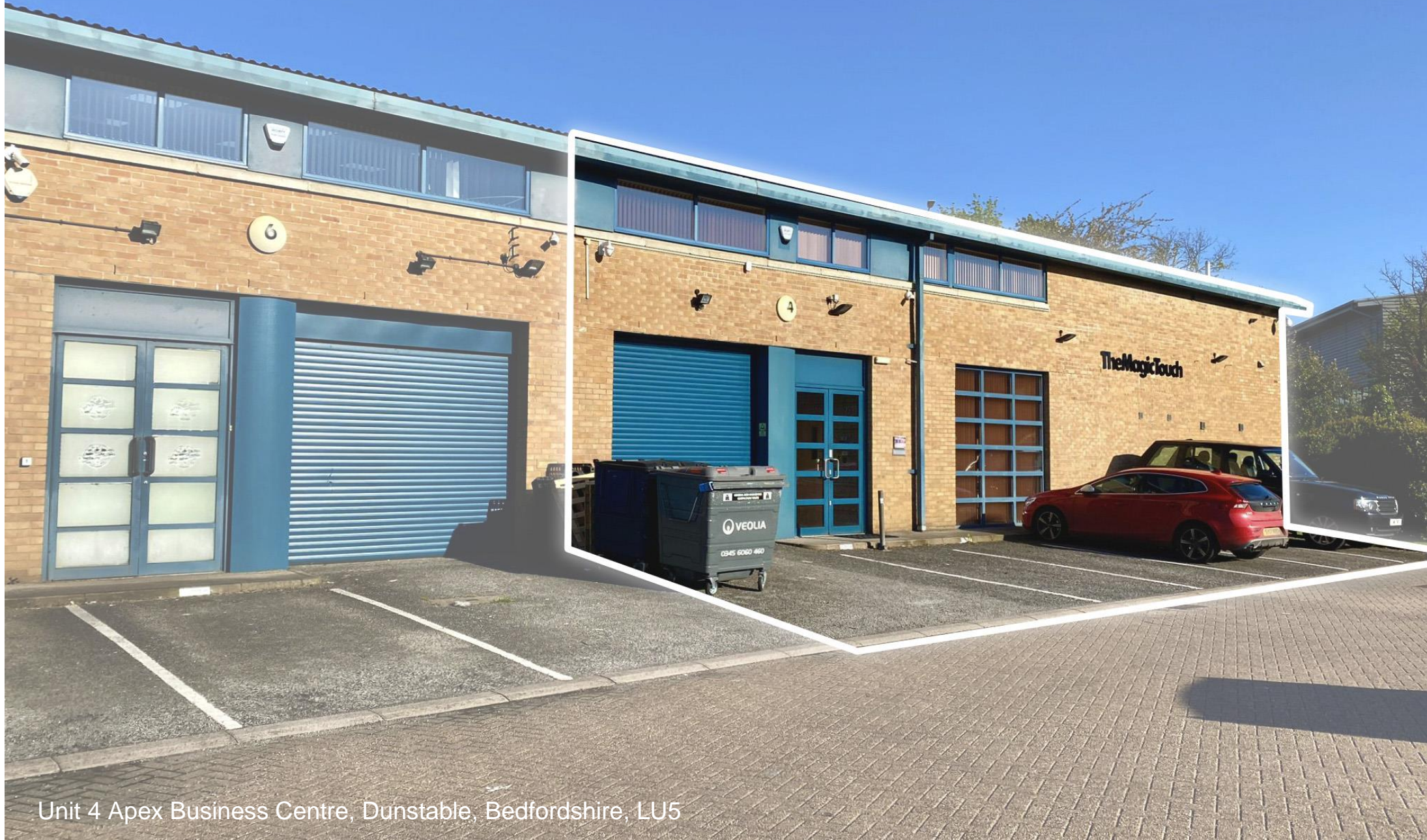
Unit 4 Apex Business Centre, Dunstable, Bedfordshire, LU5